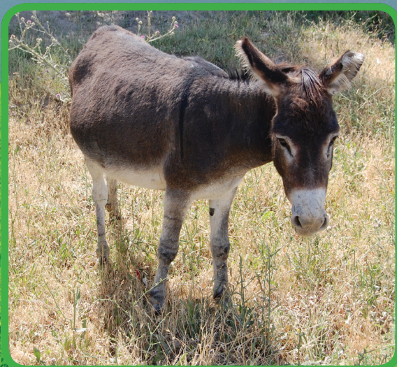
A Donkey in Corfu